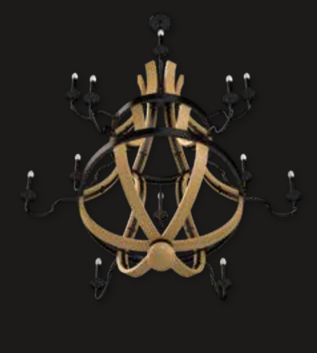
OAK / OIL RUBBED BRONZE